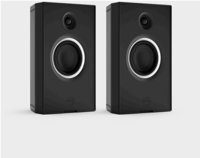
UNIT-4 Wireless+ (pair)